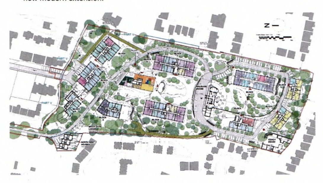
Figure 4.14 - 'Garden' Level - showing ground floor plan of each Block