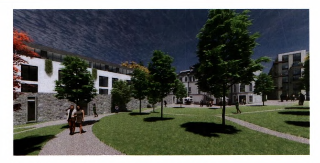
Figure 3.9: Proposed s247 scheme, walled garden looking north.