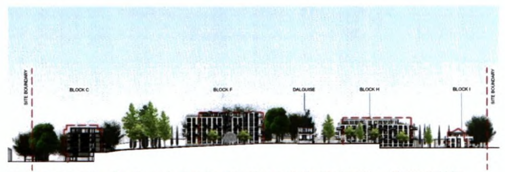
Figure 3.5: Section showing submitted application with Design iteration 02 overlaid in magenta.