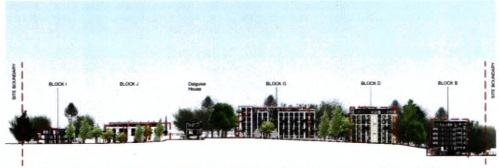
Figure 3.6: Section showing submitted application with Design iteration 02 overlaid in magenta.