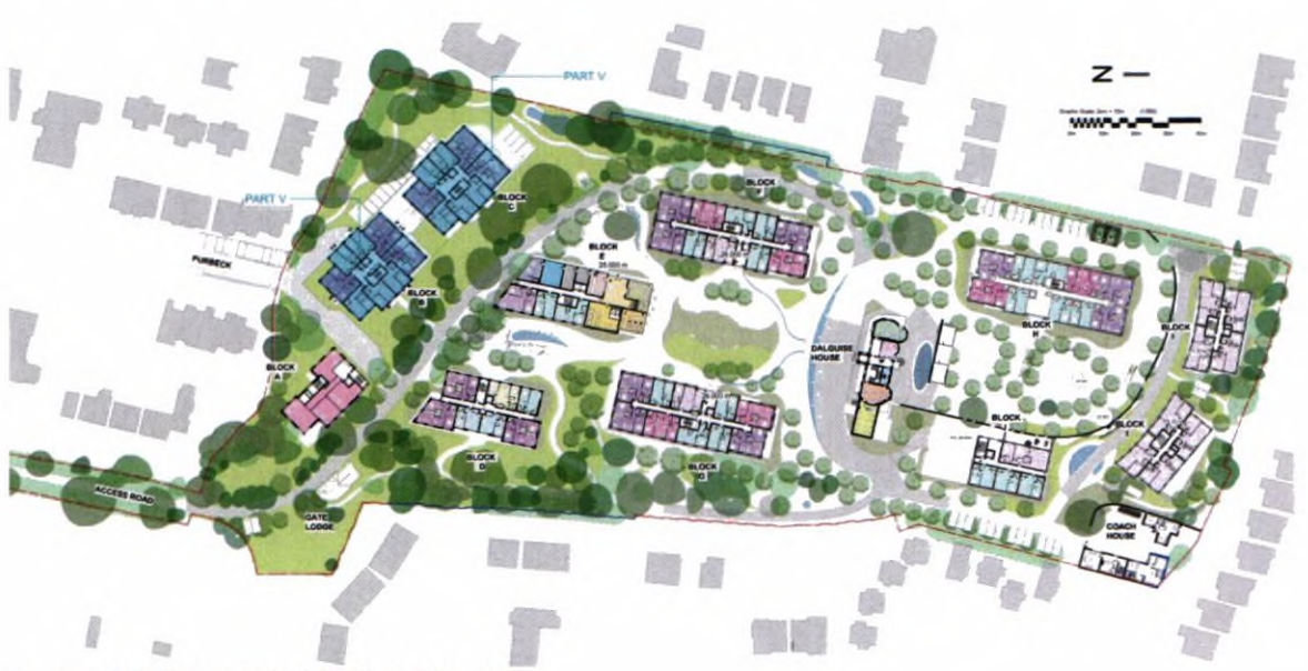
Figure: 3.3 Site Layout of Design Option 02

This new proposed scheme comprises 11 no. new apartment blocks ranging from 3-9 storeys and the full restoration of 4 existing structures of which the only Protected Structure is the Dalguise House being converted into Residential at level 01, residents' amenity at ground level and a public F+B offering at lower ground level.