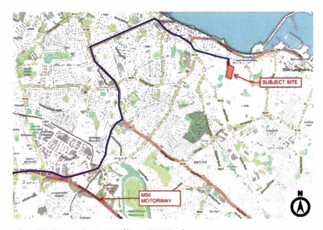
Figure 2.2: Construction Route 1.

Route 1 (Accessing the site, same return trip): Via the M50 onto the N31 at Leopardstown, left onto the N11 (Stillorgan Road), right onto N31 (Mount Merrion Avenue), right onto Frascati Road, left on to R119 (Monkstown Road).