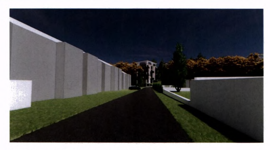
Figure 3.7: Early design view of the scheme from Purbeck