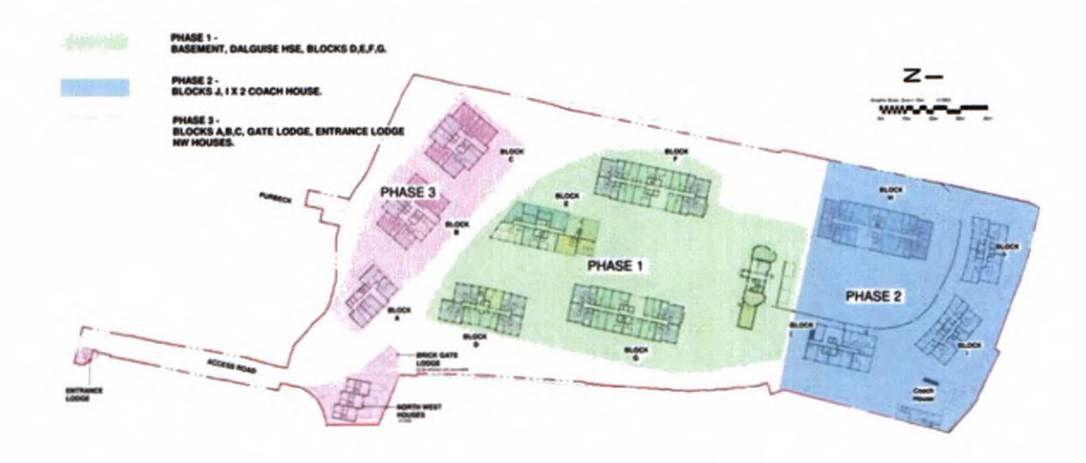
Figure 2.1: Illustrative Plan showing proposed construction phasing.

The final phasing and associated Construction Traffic Management Plans shall be submitted by the appointed Contractor to Dún Laoghaire Rathdown County Council for approval prior to commencement.