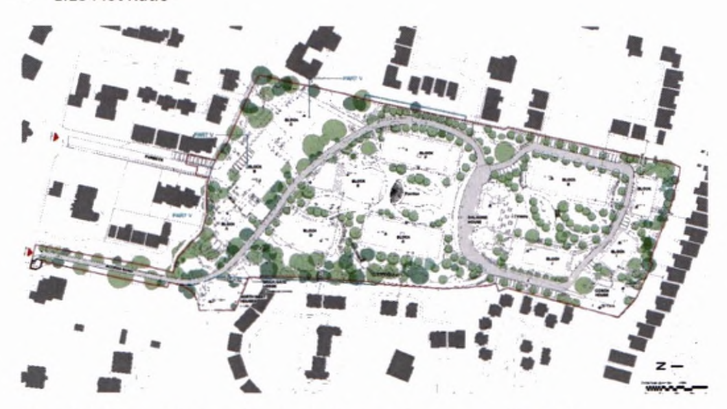
Figure 4.13: Proposed Site Layout Plan showing layout and arrangement of the Blocks.

The design changes from the previous iteration are as follows: