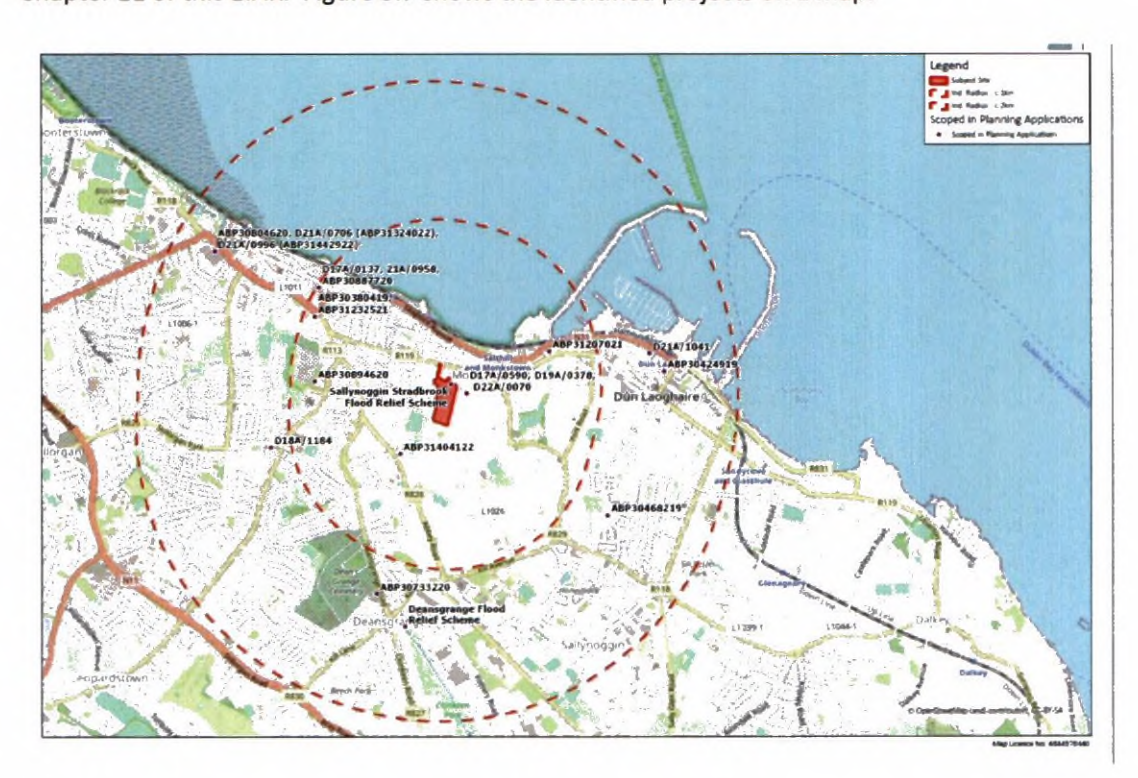
Figure 18.1: Map showing surrounding development selected for the purposes of cumulative impact assessment.

A number of development projects in the surrounding area have been identified as relevant to the assessment of environmental impacts associated with the proposed project, from a cumulative perspective. The methodology surrounding the selection of the below projects, which are located within a spatial limit of c. 2km radius of the site boundary, is detailed in Chapter 21 of this EIAR. Figure 3.7 shows the identified projects on a map.