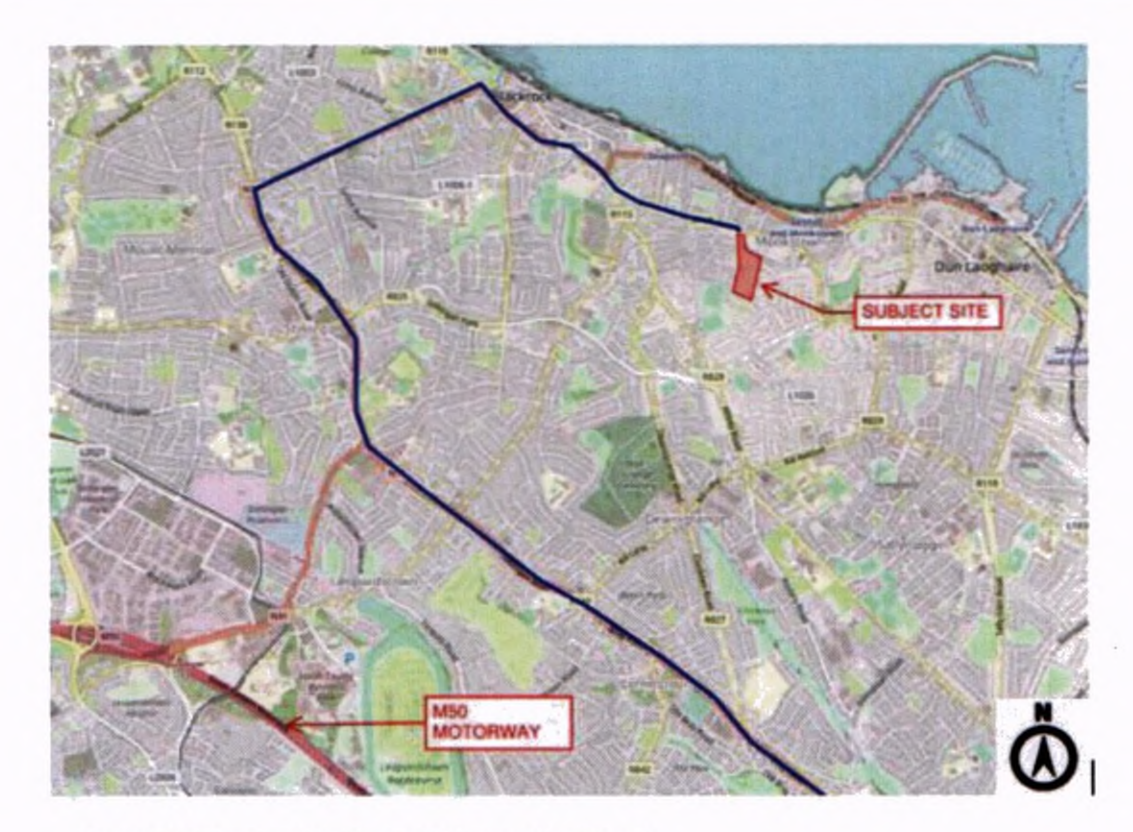
Figure 2.3: Construction Route 2

The following are some measures that will be implemented to accommodate smooth traffic flows: