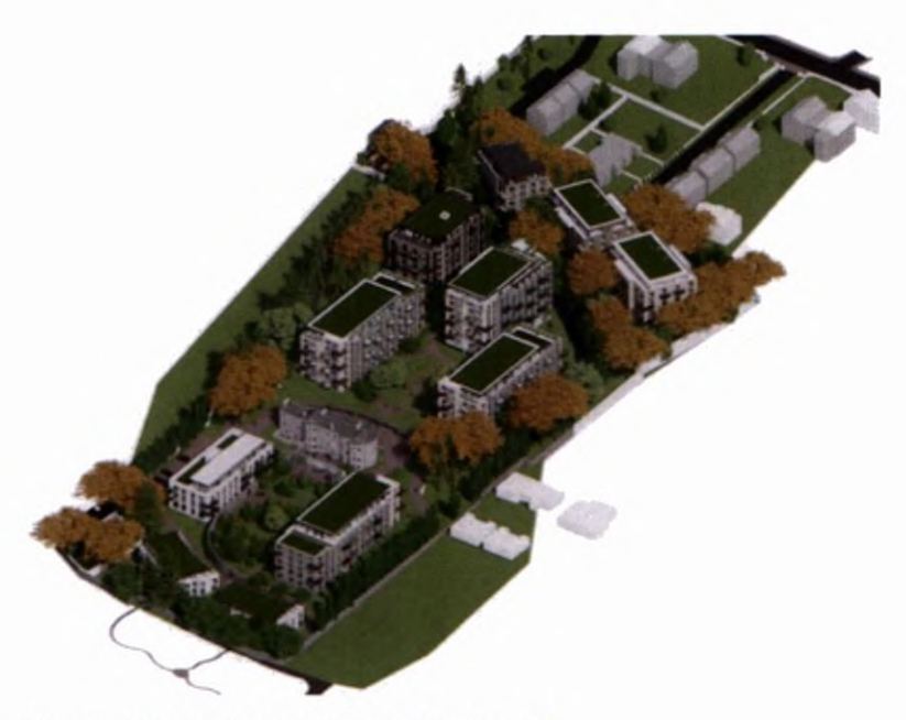
Figure 3.2: Isometric View of Alternative design 01

The previous scheme proposed two way accesses at both Purbeck and Dalguise House Access. The former required severe gradients requiring significant removal of trees to meet the Dalguise House Access. The scheme included provision for permeability connections to surrounding land to improve overall connectivity for sustainable modes in the area.