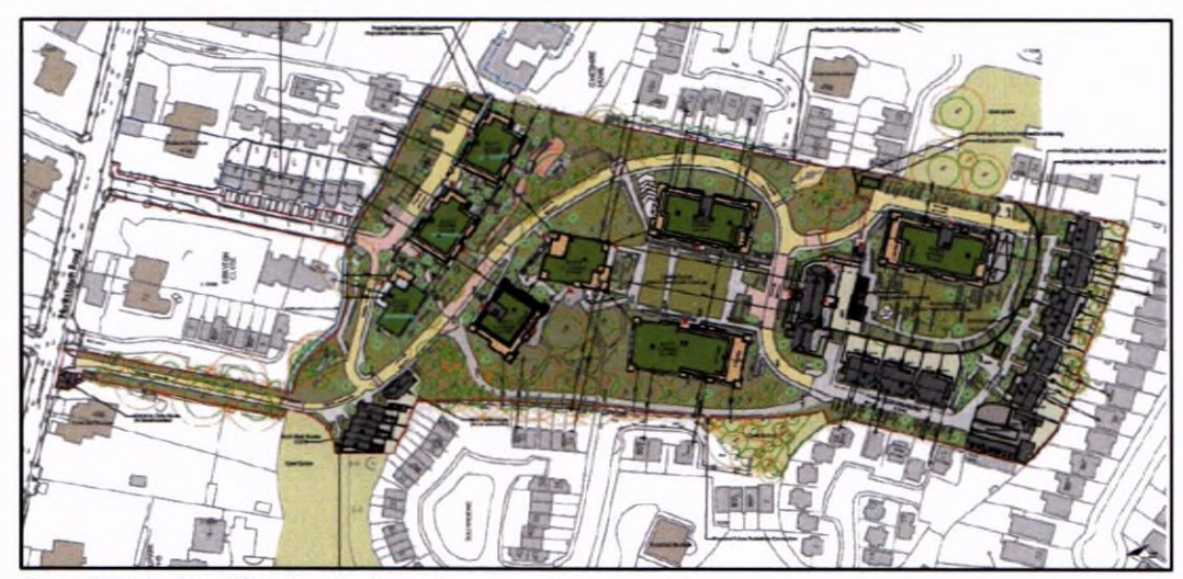
Figure 3.1: Previous Planning Site Layout.

The figure above shows the site layout plan for the previous planning application submitted in 2020. This design comprises 290 No. units, a childcare facility and associated development. The 8 No. new apartment blocks (266 No. units) ranged in height from 5-9 storeys, some over podium level. 22 No. houses were included (including the converted stable yard and refurbishment of an existing gate lodge). Dalguise House was to be converted into 2 No. residential units and a childcare facility at basement level. The scheme also provided 314 No. Car Parking spaces and 365 No. bicycle spaces. As part of the design process, the design team reviewed the design, considered the positive design decisions to be brought forward into the next iteration and discounted the elements that didn't work.