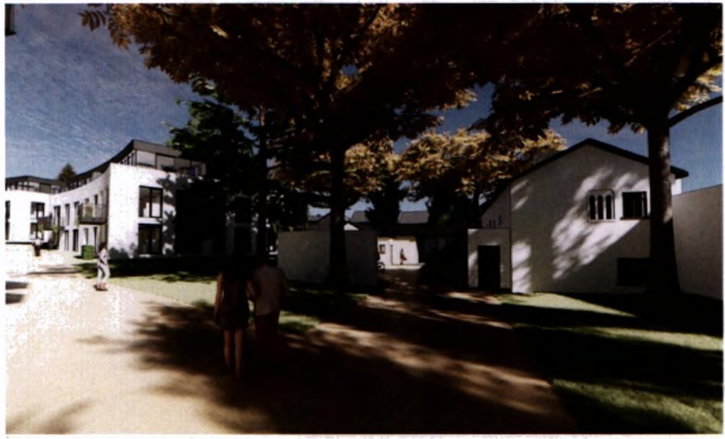
Figure 4.17 - Draft CGI View of the Coach House and Mews character area (Blocks i)

The proposed project constitutes the final alternative, and preferred, option. The design has been progressed via an iterative process with design amendments arising from consultation with Dún Laoghaire Rathdown County Council during the pre-application process. The current scheme takes account of both planning and environmental considerations arising throughout the design process. This planning application submission, which includes this EIAR, provides a full assessment of the proposed project from a planning and environmental perspective.