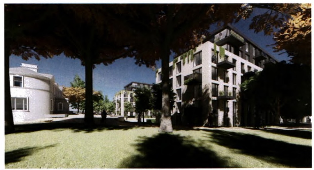
Figure 4.15 - Draft CGI View of Blocks FG and Dalguise House